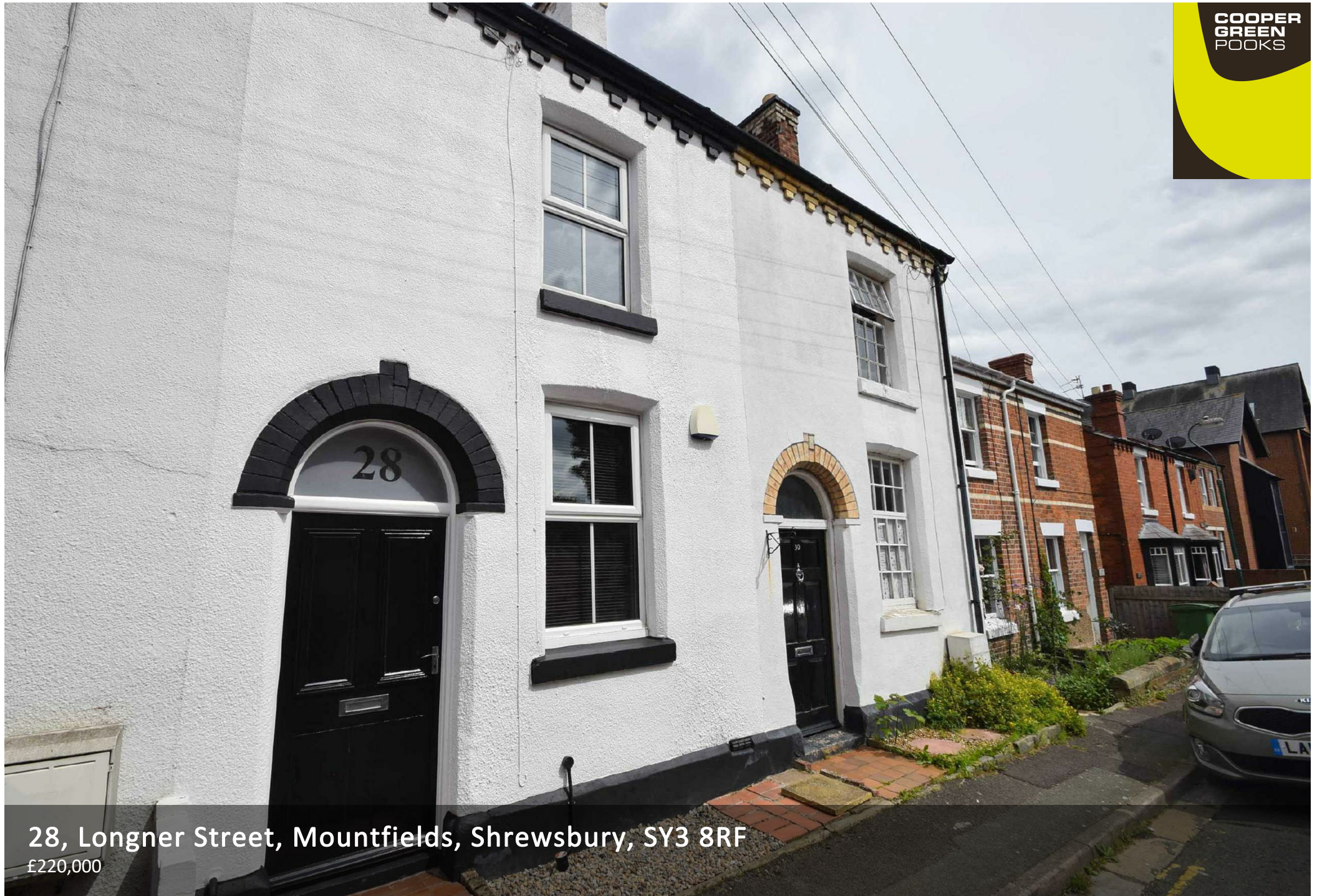
28, Longner Street, Mountfields, Shrewsbury, SY3 8RF £220,000